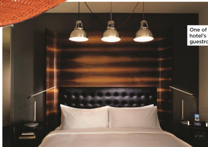
One of the hotel's 116 guestrooms.

The Viceroy Hotel Group opens the doors to Hotel Zetta this month, one hundred years after the building's original construction. With a focus on sustainable materials, the boutique SoMa property reflects the Bay Area's tech savvy as well as the brand's impeccable sense of design. From $225/night; 55 5th St., S.F., 415-543-8555; hotelzetta.com.