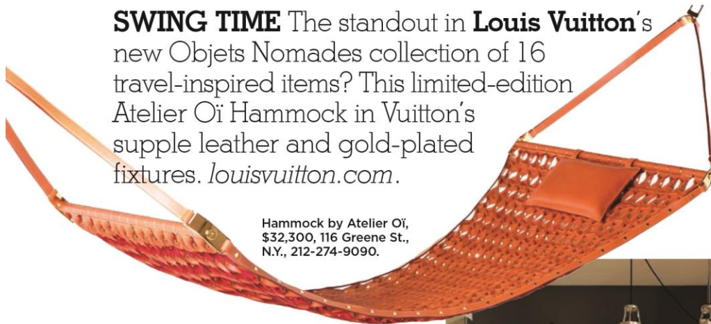
Hammock by Atelier Oï, $32,300, 116 Greene St., N.Y., 212-274-9090.

SWING TIME The standout in Louis Vuitton's new Objets Nomades collection of 16 travel-inspired items? This limited-edition Atelier Oï Hammock in Vuitton's supple leather and gold-plated fixtures. louisvuitton.com .